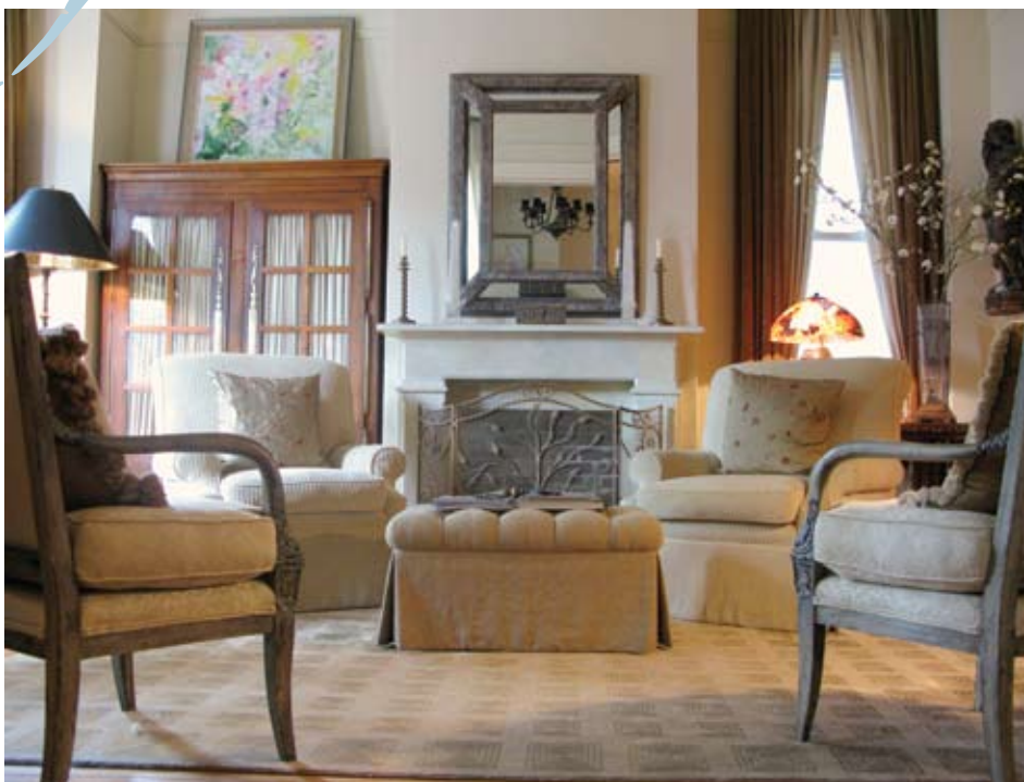
▲ Chic and comfortable, this living room depicts what designers call relaxed luxury. ► An elegant dining room with an air of romance fits nicely with this historic house's ambiance.

There's planning, preparation, time element and ingredient choices. The difference is that once you've made your decisions about your home, the ingredients are more permanent. So take your time. Choose a decorator you can talk to and relate with.